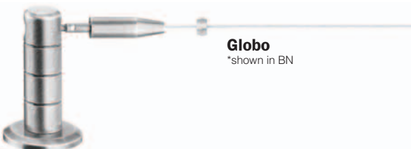
Globo *shown in BN