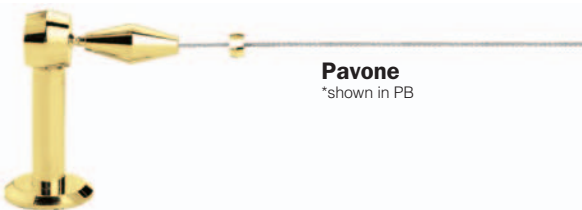
Pavone *shown in PB