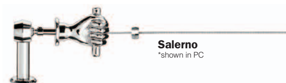
Salerno *shown in PC