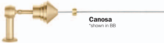
Canosa *shown in BB