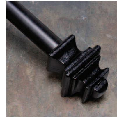
ACADEMY FINIAL 3"L 2.25"H