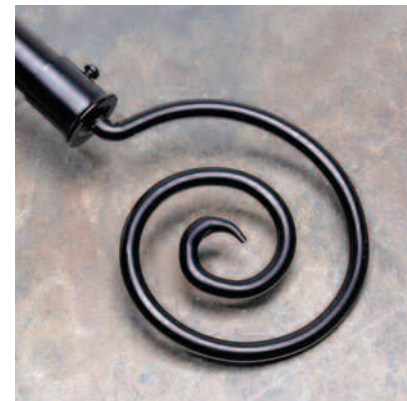
SPIN FINIAL 7"L 5"H