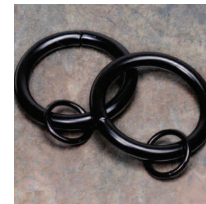
RING 1.5" diameter