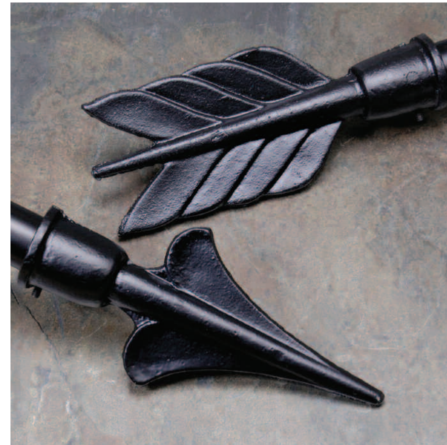
HARPOON/FEATHER 7.5"L 3"H