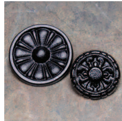
LARGE ROSETTE (left) 2.5" diameter SMALL ROSETTE (right) 2" diameter