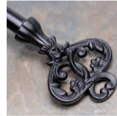
KEY FINIAL 6.25"L 4.5"H