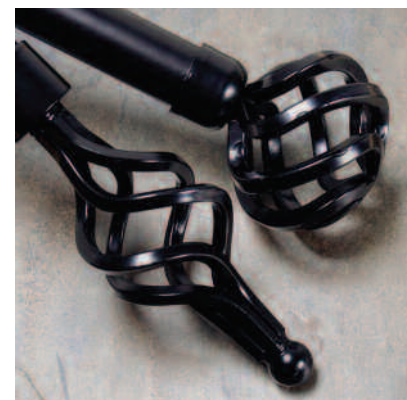
GLOBE FINIAL (top) 3.25"L 3.25"H HELIXA FINIAL (bottom) 6.75"L 2.5"H