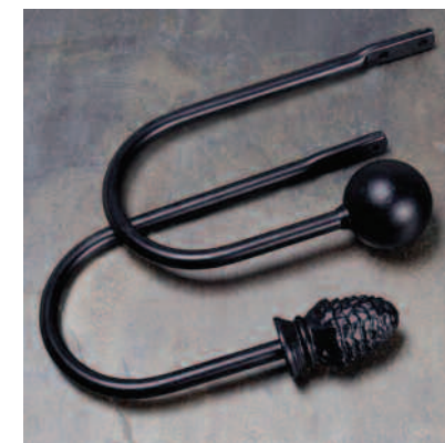
RADIUS TIEBACK (top) 4.25" projection PINECONE TIEBACK (bottom) 4.1" projection