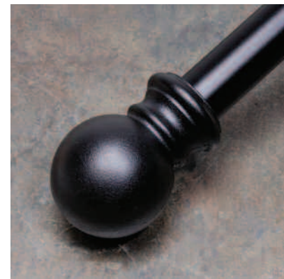
CENTURY FINIAL 3"L 2"H