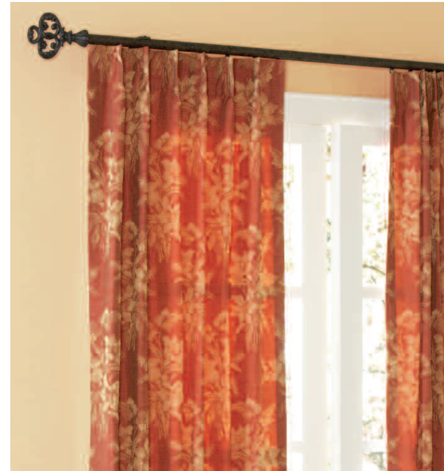
HAND-DRAW TRAVERSE SYSTEM SHOWN WITH CENTER DRAW OPTION