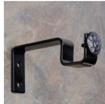
STANDARD, EXTENDED BRACKET (Shown with Hammered Rosette) Standard bracket projects 3.5" Extended bracket projects 5.5" and 8" Hammered Rosette 1" diameter