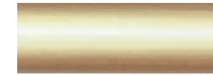
ANTIQUE BRASS 1