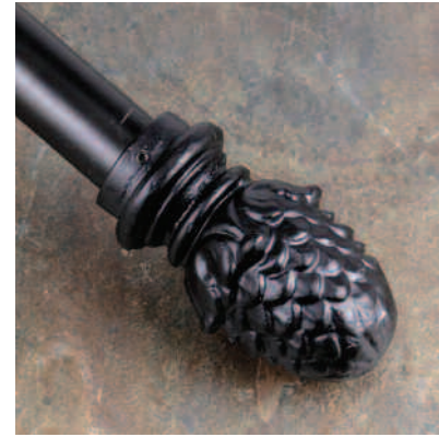
PINECONE FINIAL 3.5"L 2"H