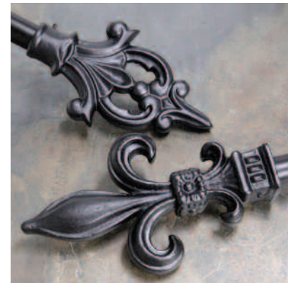
SCEPTER FINIAL (top) 7.5"L 4.25"H JESTER FINIAL (bottom) 9.5"L 5"H