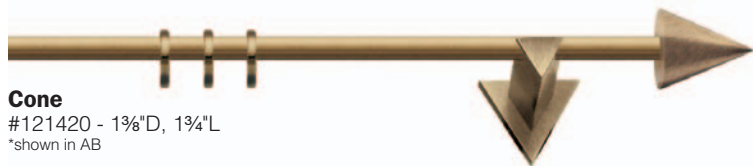
Cone #121420 - 1 3/8"D, 1 3/4"L *shown in AB