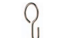
Ring Hook #019500 - 7/8"D, 1 3/4"L