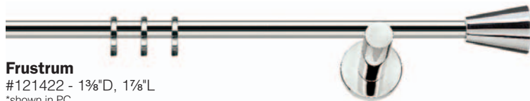
Frustrum #121422 - 1 3/8"D, 1 7/8"L *shown in PC