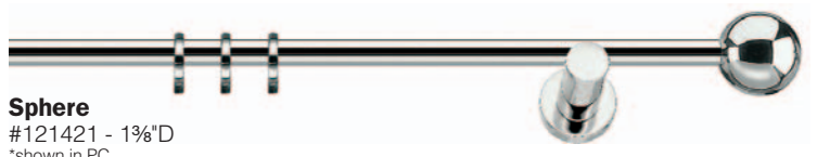
Sphere #121421 - 1 3/8"D *shown in PC