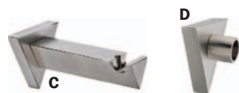
Triangle C. wall bracket #122813 - 1 3/4"H, 3 1/8"P #122814 - 1 3/4"H, 4 3/4"P D. inside mount #122815 - 1 3/4"H, 1"L