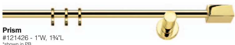
Prism #121426 - 1"W, 1 3/4"L *shown in PB