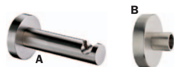
Circle A. wall bracket #122802 - 1 3/4"D, 2"P #122803 - 1 3/4"D, 3 1/8"P #122804 - 1 3/4"D, 4 3/4"P B. inside mount #122805 - 1 3/4"D, 1"L