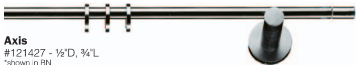
Axis #121427 - 1/2"D, 3/4"L *shown in BN