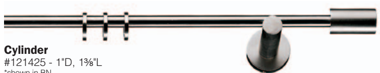
Cylinder #121425 - 1"D, 1 3/8"L *shown in BN