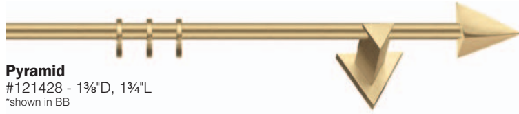
Pyramid #121428 - 1 3/8"D, 1 3/4"L *shown in BB