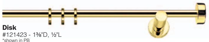
Disk #121423 - 1 3/8"D, 1/2"L *shown in PB