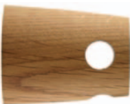
Scott #212267 3"H, 2 3/4"P *pictured in LO, DO available