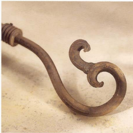
SCROLL 5.25"L 3.25"H finishes: AN, BL, DS