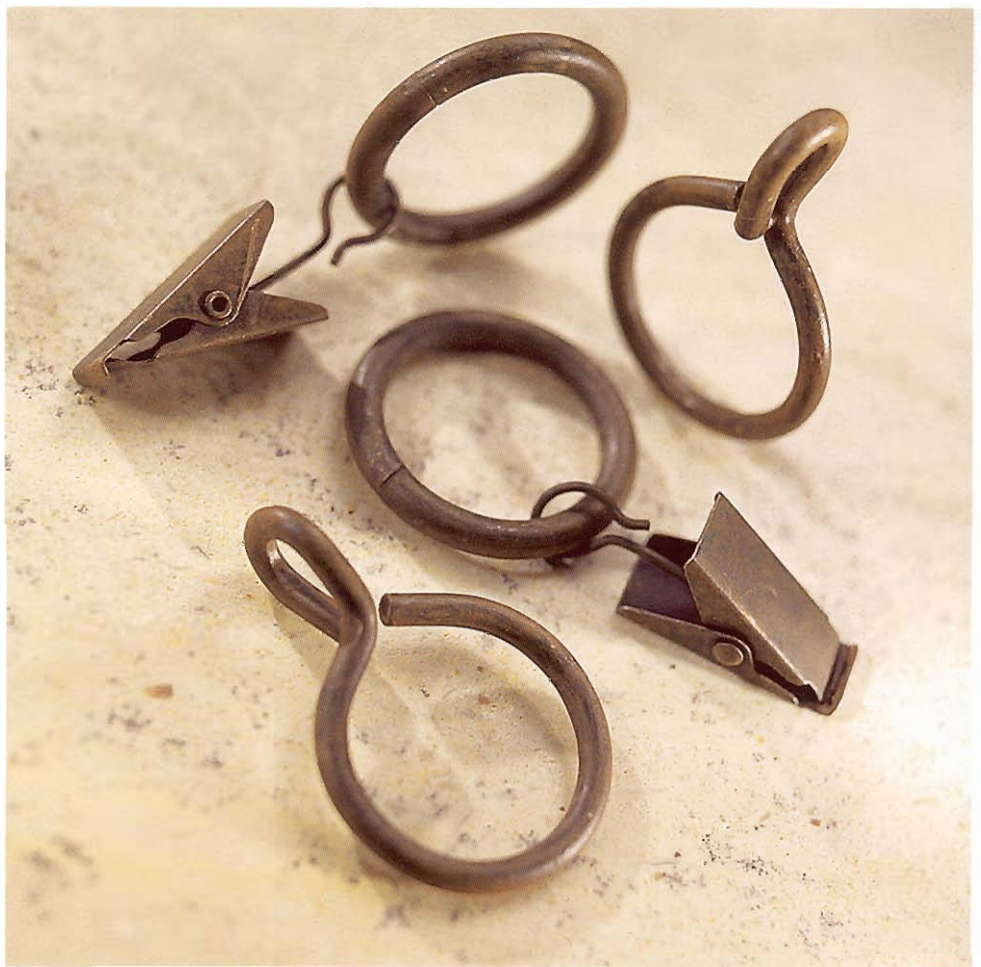
RING AND RING CLIP 1" diameter, finishes: AN, BL, DS