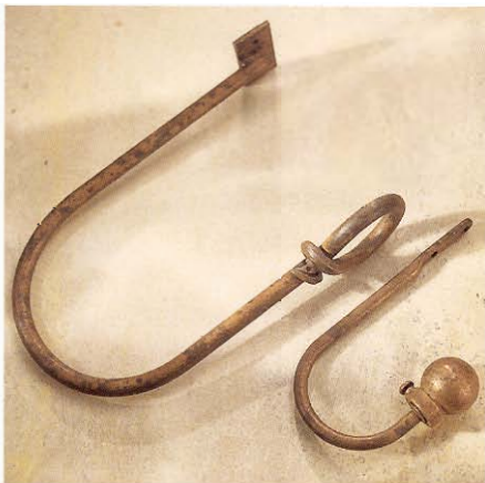
TWIST (top) 8" length, 5.5" extension SPHERE (bottom) 4.5" length, 3.5" extension finishes: AN, BL, DS