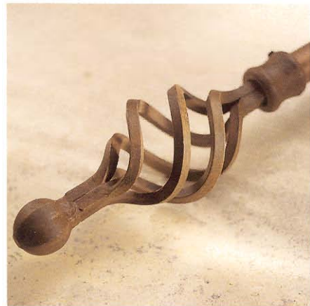
SPIRAL 7"L 2.5"H finishes: AN, BL, DS