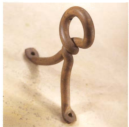
DECORATIVE BRACKET 3" projection finishes: AN, BL, DS