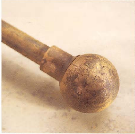
SPHERE 2.25"L 2"H finishes: AN, BL, DS