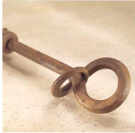
KNOT 6.75"L 2.5"H finishes: AN, BL, DS