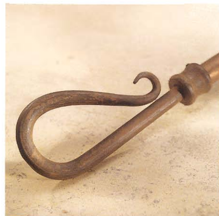
LOOP 5.5"L 2.5"H finishes: AN, BL, DS