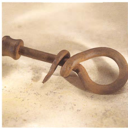
TWIST 7"L 2.5"H finishes: AN, BL, DS