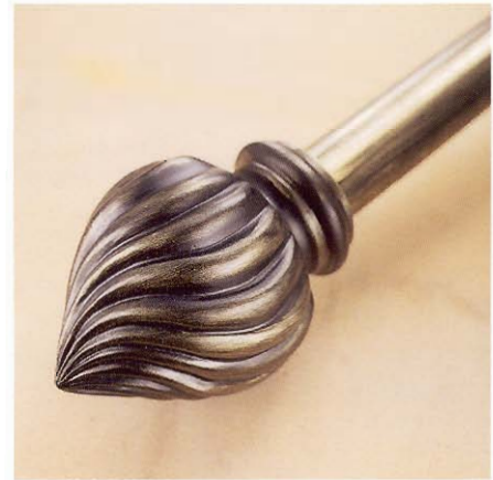
TURBAN (1.5" rod only) 5.5"L 4"H finishes: WS, SD, AG