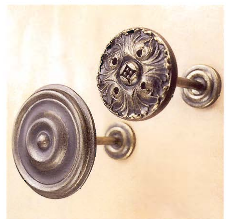
tieback RADIUS (left) 4.25" diameter, FLORAL (right) 2.75" diameter both tiebacks have 3.5" extension finishes: WS, SD, AW, AN, AG