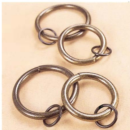
RING 1.5", 2" diameter, finishes: WS, SD, AW, AN, AG