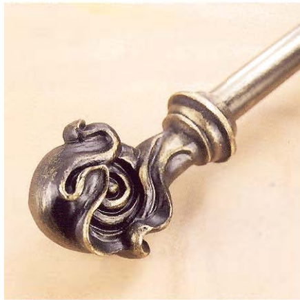
CORINTHIAN (1" rod only) 5.75"L 3.5"H finishes: WS, AN, AG