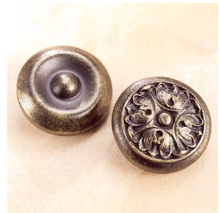
RADIUS (left) 2.25" diameter, rosette FLORAL (right) 2" diameter, rosette finishes: WS, SD, AW, AN, AG