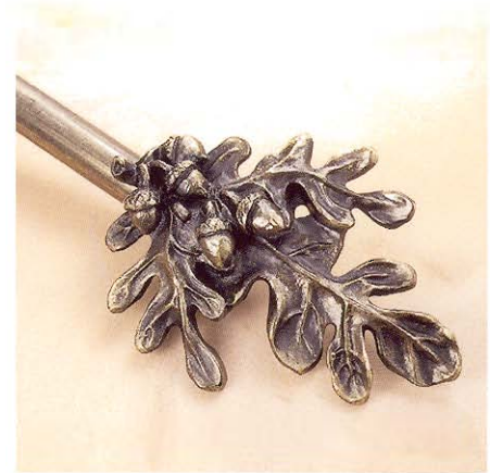
NOISETTE (1" rod only) 8"L 5.5"H finishes: WS, SD, AN, AW, AG