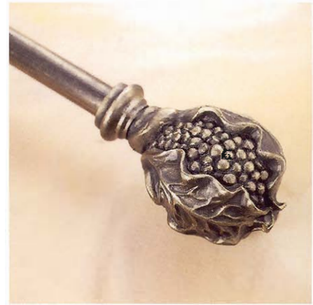
POMEGRANATE (1" rod only) 5.75"L 4"H finishes: AW, SD, AG