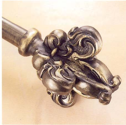
QUATREFOIL (1.5" rod only) 7.25"L 6.25"W finishes: WS, AN, AW, AG