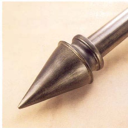
CONE (1.5" rod only) 5.5"L 3.25"H finishes: WS, SD, AW, AG