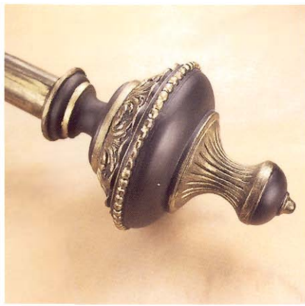
CALIZ (1.5" rod only) 8.25"L 5.5"H, finishes: WS, AN, AG