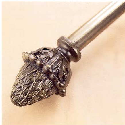
PINO (1" rod only) 4"L 3"H finishes: SD, AW, AG